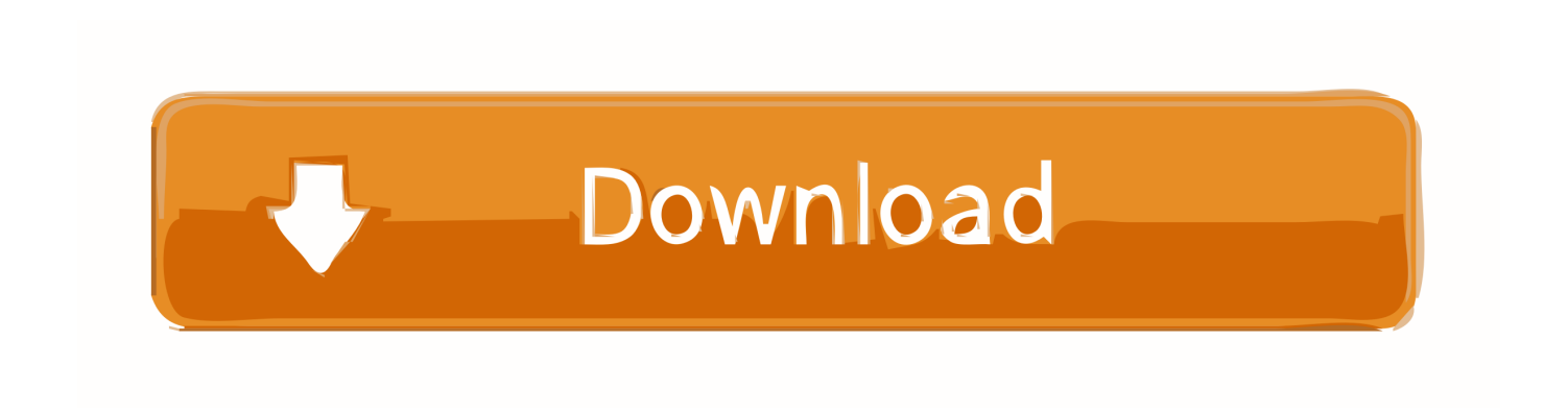
Inventor 2012 Scaricare Gratis 64 Bits Italiano